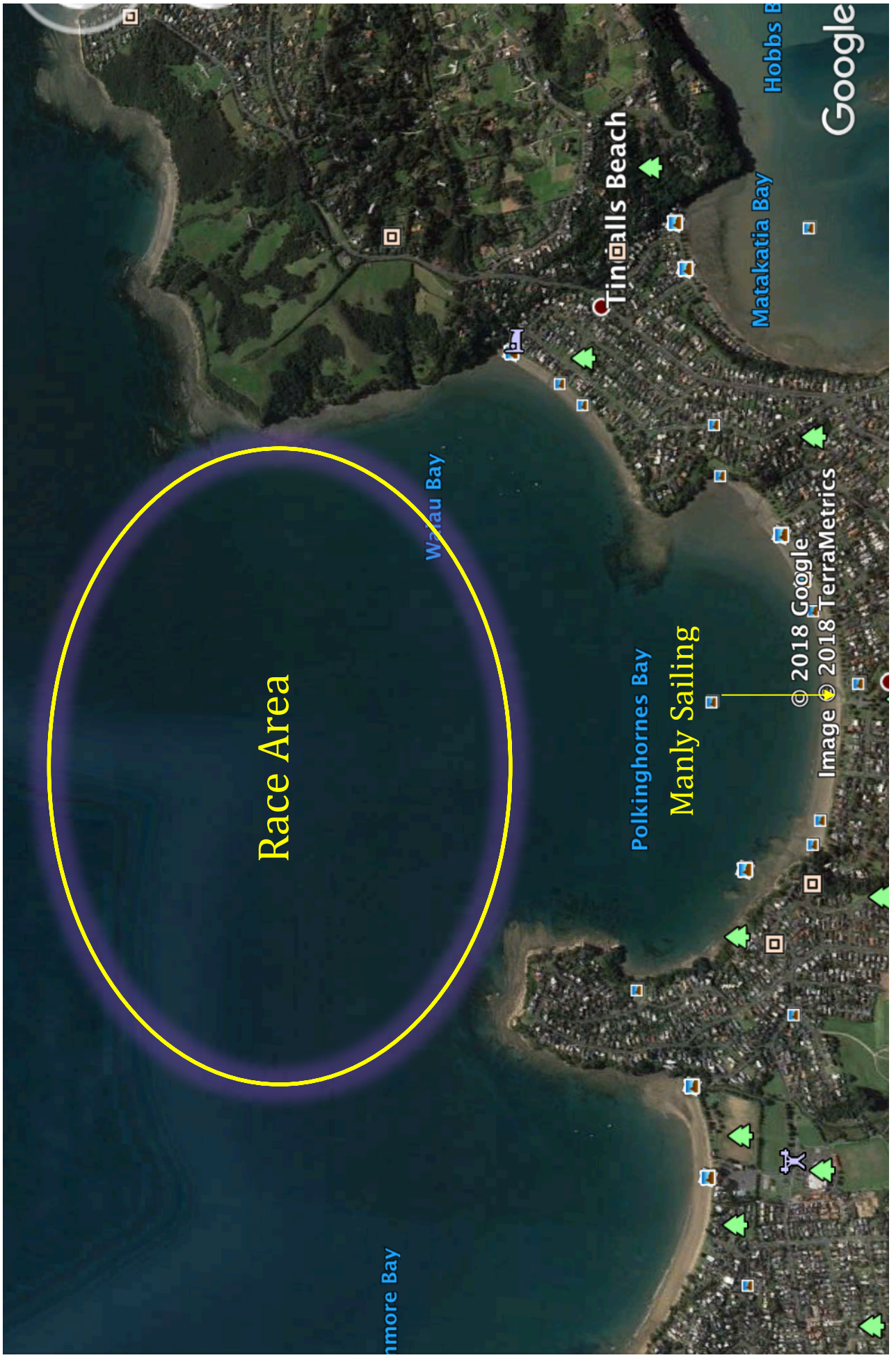
Manly Sailing Club